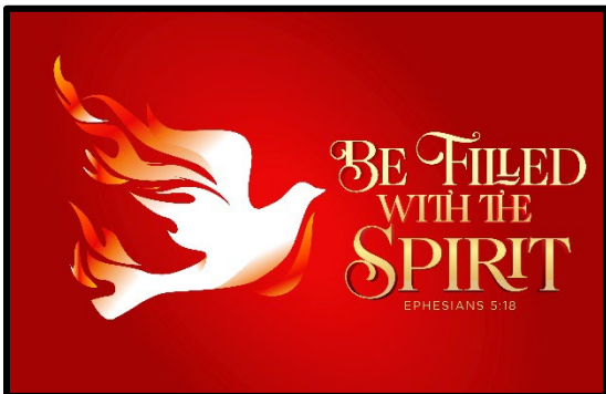
The Holy Ghost is promised to every believer. You cannot live a successful Christian life without it.

To teach us all things and bring back to our remembrance what have been taught to us.